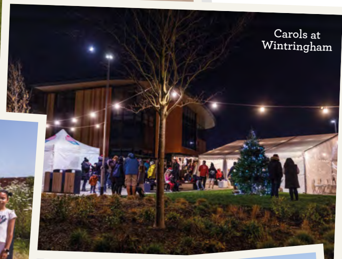
Carols at Wintringham