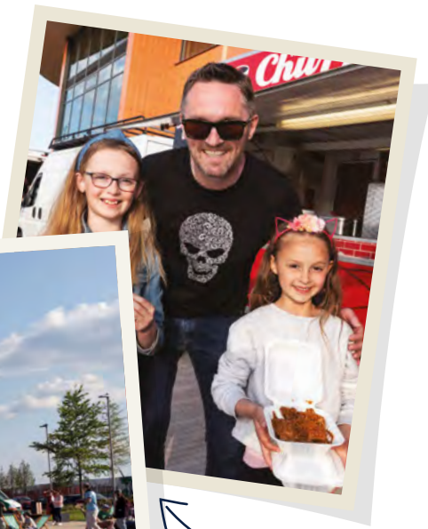
Street Food Saturdays