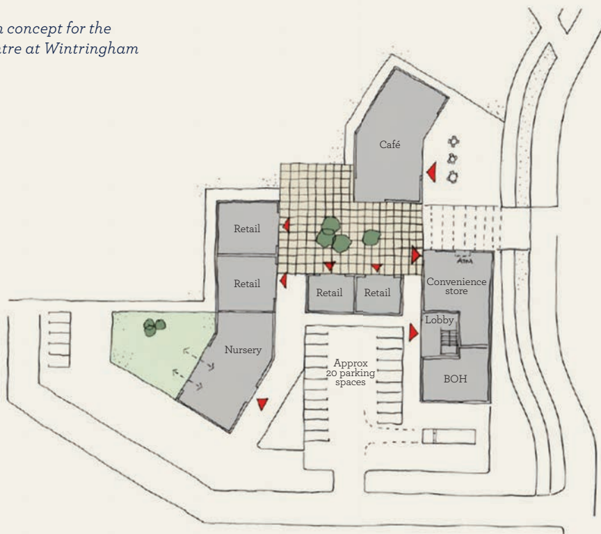
Early design concept for the District Centre at Wintringham

As Wintringham continues to grow we are making plans for the new development's future community hub, the District Centre, which will include a convenience store as well as a nursery, gym, library and community centre and café. There will also be a plaza/central space for people to meet and relax, with room around it for the future health centre and commercial space for new businesses and innovation.