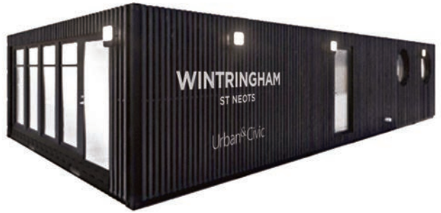
The new Urban&Civic offices on Nuffield Road