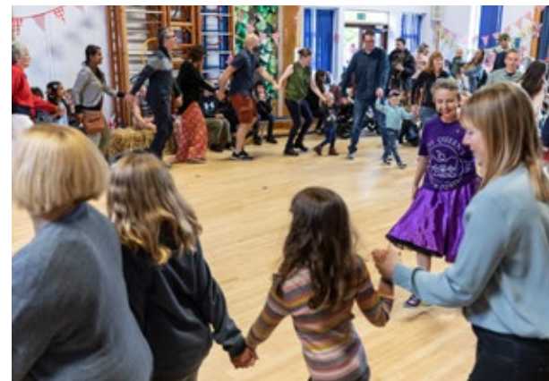
Community Jubilee celebrations

Escalations: Unauthorised HGV construction traffic on Pelham Road has reduced significantly, thanks to the intervention of Urban&Civic and support from developers' project teams. There is still work to be done on repeat offenders, but a big thank you to the team for their work so far!